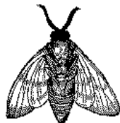
Figure 2: A sample black and white graphic (.eps format) that has been resized with the epsfig command.

This uses the theorem environment, created by the